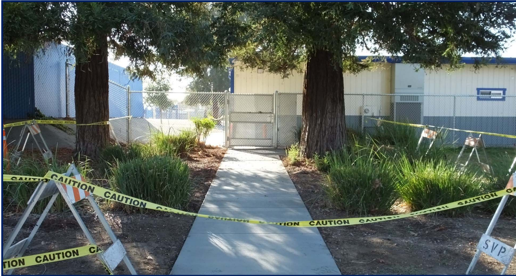
Toyon Elementary School – Concrete Work