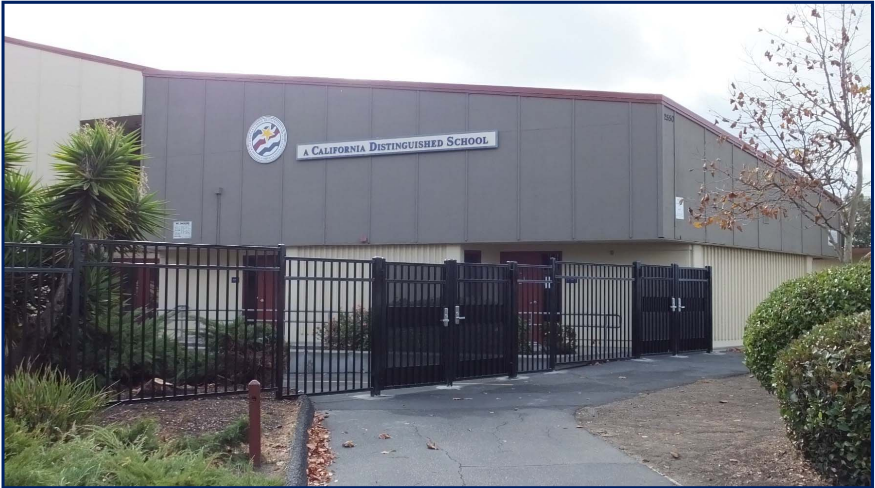
Cherrywood FIS – Fencing