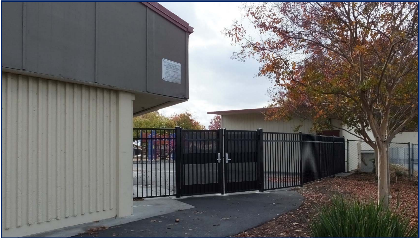
Cherrywood FIS – Fencing